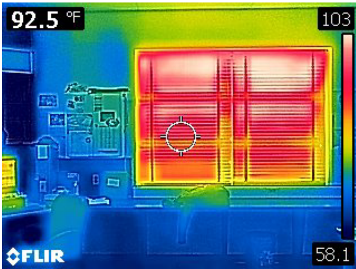
See the impact that solar gain has on a wall with windows.