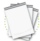
Plastic shipping envelopes