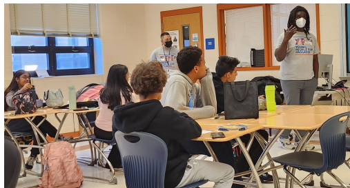
Our guest speaker from Young People for Progress

On December 20th I will hold a meeting for seniors during 4th period advisory. This meeting will focus on the process and expectations for the Senior Showcase.