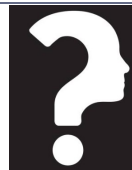
Class of 2027

Can't wait to meet our amazing freshman!